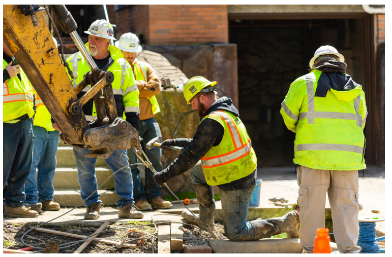
PWSA contractor crews coordinate a successful lead service line replacement.

▶ When you spot PWSA crews in your neighborhood working on water lines, lining sewer pipes, or rehabbing aging infrastructure, you can be confident that those efforts will, over time, result in fewer service interruptions like water main breaks and low-pressure events, which may have caused boil water advisories in the past.