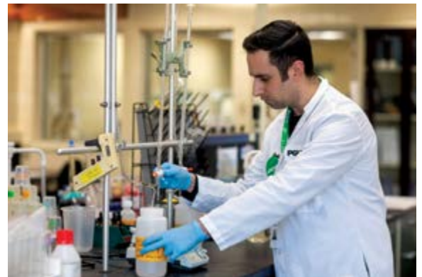
The scientists and chemists at our certified lab perform hundreds of water quality tests each day to ensure the safety and quality of our drinking water.

At PWSA we employ rigorous monitoring and testing procedures to ensure the continued delivery of clean and safe water to your home or business. Our 2022 Annual Water Quality Report, released in June 2023, found that PWSA meets and exceeds all regulatory requirements and in July we reported the lowest lead levels in decades. At 3.4 parts per billion (ppb), our corrosion control continues to be effective in keeping lead levels low for those who still have lead service lines or internal lead plumbing.