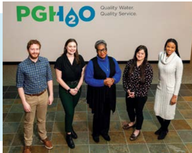
The PGH2O Cares team builds awareness and enrolls income-eligible customers in our financial assistance programs.