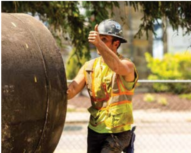
The rehabilitation of Rising Main 4, completed in 2023, strengthens our water distribution system and will reliably serve customers for years to come.

New rates, going into effect on February 15, 2024, will enhance customer assistance, offer a one-time rain barrel credit, and provide funding to advance infrastructure investment.