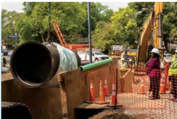
PWSA construction crews install a segment of Rising Main 4, a large water distribution pipe, in the vicinity of Highland Park.