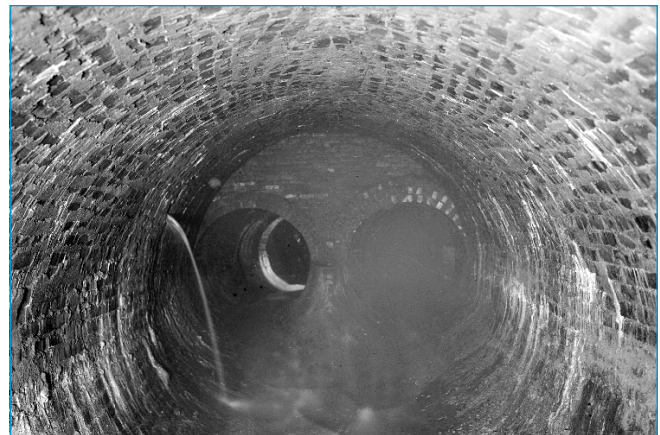
The Boundary Street sewer in Four Mile Run in Oakland in 1911.

Nearly a century ago, the natural stream in this area was diverted underground through pipes that are now part of our combined sewer system. This system sends sewer and stormwater directly to the river. Over time, much of the land within Four Mile Run was paved over. While these were standard practices of the time, they are no longer acceptable and contribute to the recent problems of flooding and sewer overflows throughout Pittsburgh. The Four Mile Run stormwater improvement project will capture and route the flow of stormwater through a naturalized surface channel that will generally follow the path of the historic streams that formed Four Mile Run from Panther Hollow Lake to the Monongahela River. Panther Hollow Lake will be allowed to discharge to the Monongahela River instead of the combined sewer.