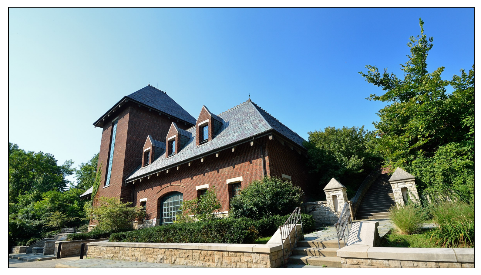
PWSA Microfiltration Plant located in Highland Park